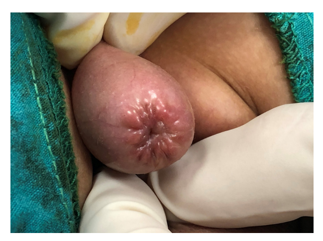
Figure 1. Grade 5 phimosis developed following thermocautery circumcision

In the four patients who developed Grade 5 phimosis after scalpel circumcision, steroid treatment did not elicit any response (0%), so surgical revision was performed. In the eight cases of Grade 4 phimosis, four responded (50%) to steroid treatment. After treatment, one of these (25%) cases improved to Grade 0, and three cases (75%) to Grade 1. Surgical revision was performed for four patients (50%) who did not improve. Six of the eight (75%) patients with Grade 3 phimosis treated with topical steroid application improved to Grade 0 after six weeks of therapy. In two of these (25%) patients whose phimosis improved to Grade 2, treatment was prolonged for an additional two weeks. At a control visit one month later, their phimosis has worsened to Grade 3, which required surgical intervention. Steroid-related side effects were not observed in any case.