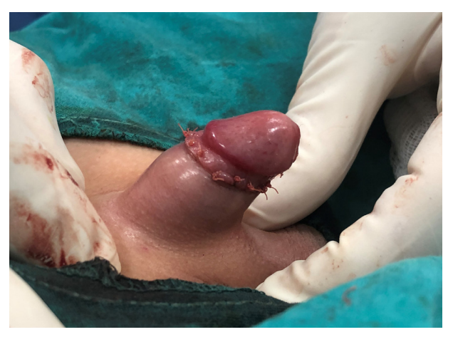
Figure 2. Appearance of the penis in figure 1 after surgical revision

Circumcision is one of the most frequently performed surgical interventions, and its application dates back to ancient times (8). Therefore, many surgical techniques and equipment have been designed for circumcision. Various complications have been observed depending on the equipment and technique used. Simple complications, such as bleeding, can develop, while critical complications such as secondary phimosis, which might require surgical re-intervention, may be seen. Krill et al reported secondary phimosis requiring reoperation in 2% of cases after circumci-